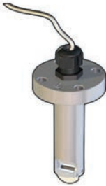
F3.20.X.01 High Pressure Paddlewheel Flow Sensor